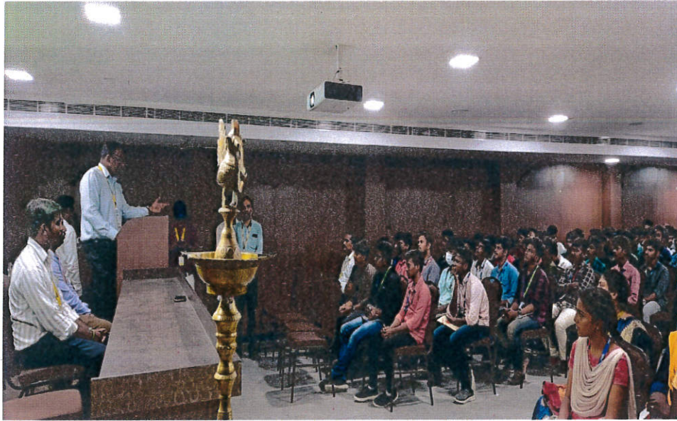
Fig 1 Vice Principal greeted the Chief Guest